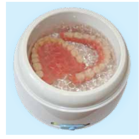
Sonic Brite in action.

"What we can learn from George Washington's experience? We should pay closer attention to not only treating recurring Tonsillitis and Strep Throat with antibiotics, but be more watchful for where these infections are lurking. We have modern day examples of contaminated sports guards and dentures, reinfecting individuals as soon as they go back to wearing them. Our dental appliances must be cleaned of all tarter build up and disinfected on a regular basis," says Keib.